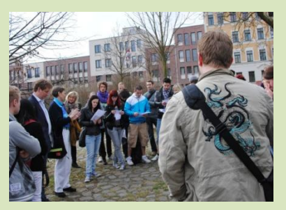
Students' seminar on new seatings