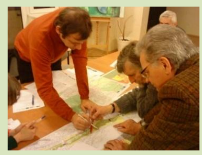
Katowice local support group meeting

REURIS project partners have been working for 18 months now and are able to present some outcomes of their efforts. This newsletter informs you of past events and future plans.