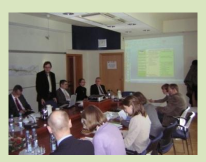
Meeting with professionals