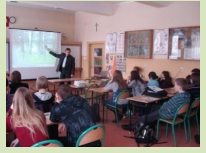
Meeting with local high school students

From October 2009 to April 2010 the project documentation (technical design) in Katowice has been completed by using analytical procedures and by involving the public. Also study works dedicated to planning a green corridor about 2,5 km long along Ślepiotka have been done.