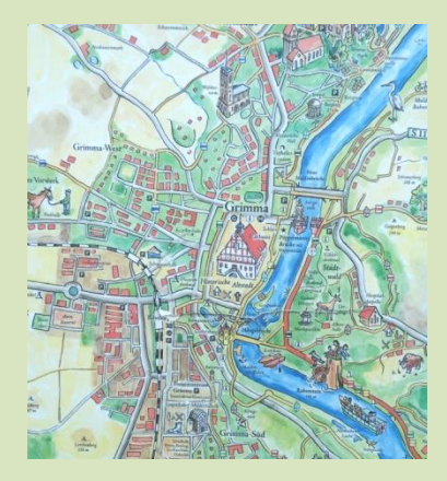
The historic centre of Grimma