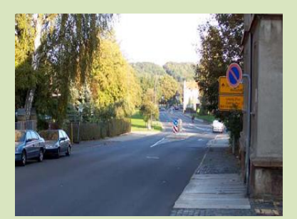
Covered creek in the centre of Grimma