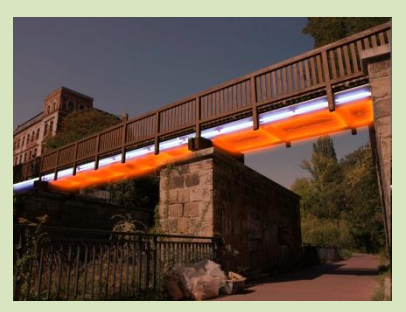
Concept of illumination