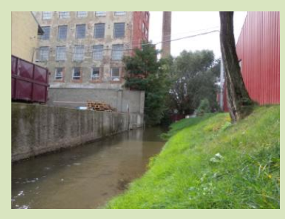
Old Ponávka in Brno

The project aims to transform the deprived Old Ponávka river into a blue-green axis, i.e. a connected system of public green spaces related to the water which will be integrated in the urban structure of Brno. The project will prepare complex revitalisation measures of this water stream and its surroundings as well as increase public awareness for the problematic of urban river spaces.